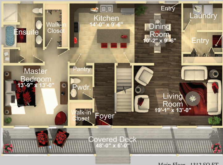
Main Floor - 1312 SQ.FT.