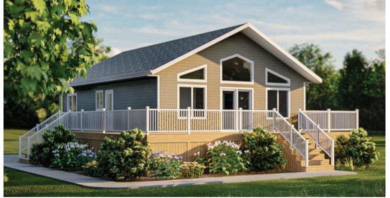
Optional Wraparound Deck Available